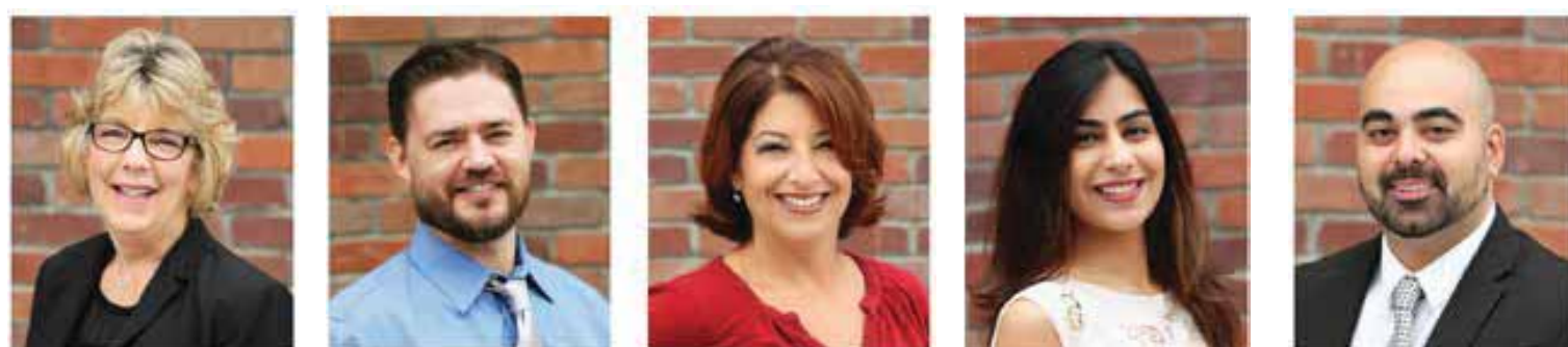
The team: Five Doctors of Audiology

Your relationship with us continues well beyond your hearing devices.